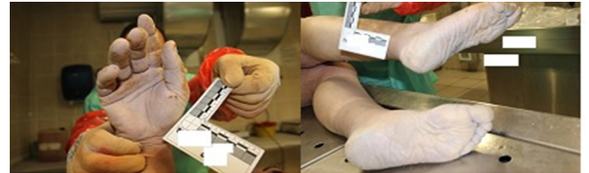
Figure 3. Maceration on the hands and feet.