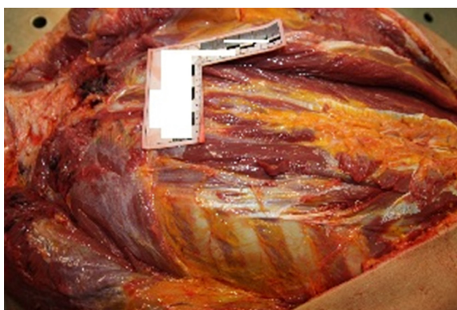
Figure 8. Intramuscular haemorrhage bilaterally in the muscle groups over the scapula.

For histopathological evaluation, separate samples were taken from the heart, brain, kidney, liver, lungs, pancreas and muscle groups and sent to the pathology laboratory in 10% formaldehyde. Following routine tissue preparation of the samples taken from the tissues, staining with haematoxylin-eosin (H-E) was applied and evaluation was made under a light microscope. In the microscopic examination, there were emphysematous changes in the lungs, intra-alveolar erythrocytes in a focal area, inflammation stasis, and focal oedema. There was perivascular and interstitial fibrosis of a mild severity in the heart and atheroma plaque at the rate of 15%-20% in the coronary arteries. In the separate evaluation