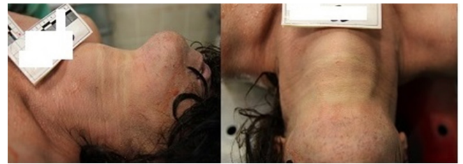
Figure 2. No abrasions and/or contusions in the anterior and posterior neck region.