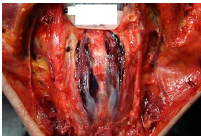
Figure 7. Haemorrhage in both paravertebral muscle groups and in the right sternohyoid muscle, an area of intramuscular.