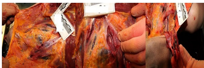
Figure 6. Haemorrhage in the left and right sternocleidomastoid muscles.